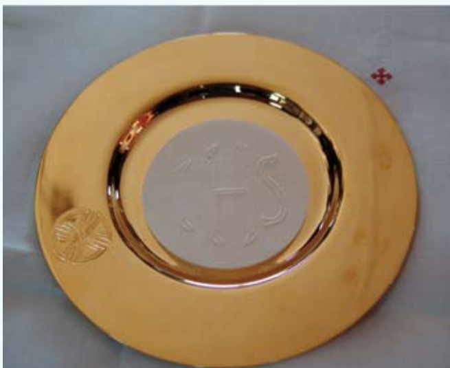
Sacred Host that came down on October 24, 2006.