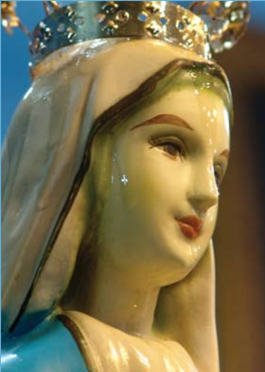
The Blessed Mother exuding fragrant oil through her statue in Naju (Oct 2, 2005)