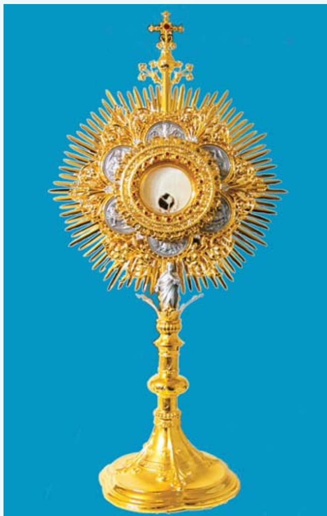
The Sacred Host that had come down from heaven on April 16, 2005 exuded the Precious Blood on May 6 of the same year and another Sacred Host came down miraculously on the Blessed Mother's House on October 24, 2006.