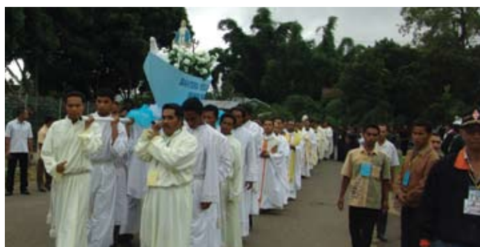
The Bishop, priests, and Julia following the Blessed Mother in her Ark of Salvation into the new church (March 25, 2007)